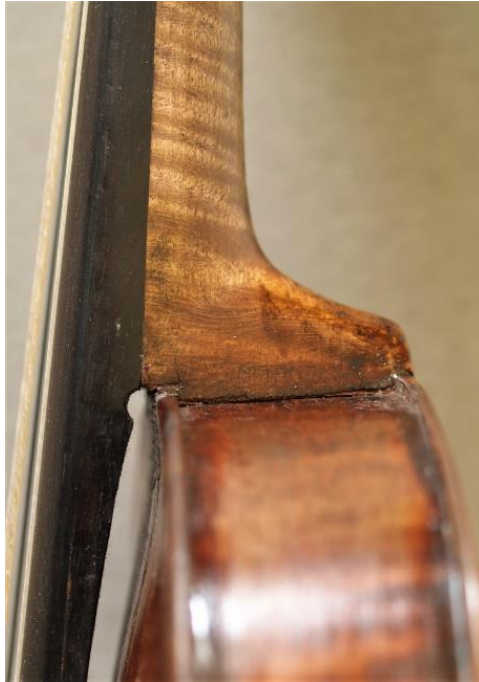
Neck – sides set into heel