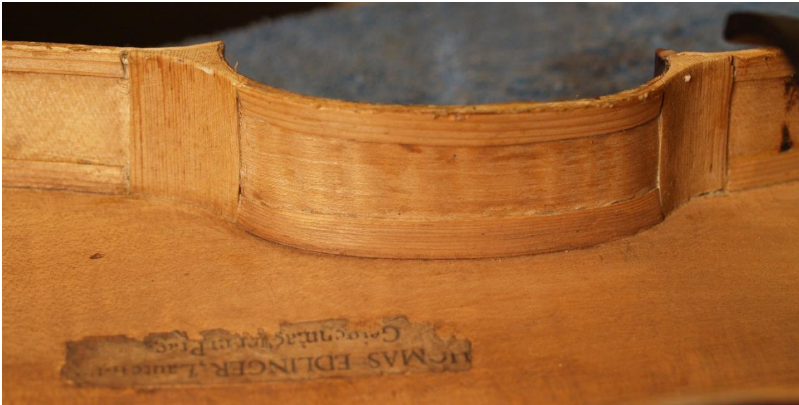
Former owner's label – Swedish? Alenius Ensemble?