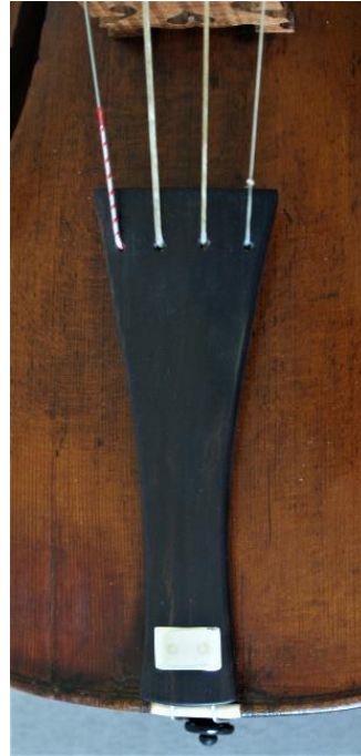
Viennese style tailpiece with silver mount